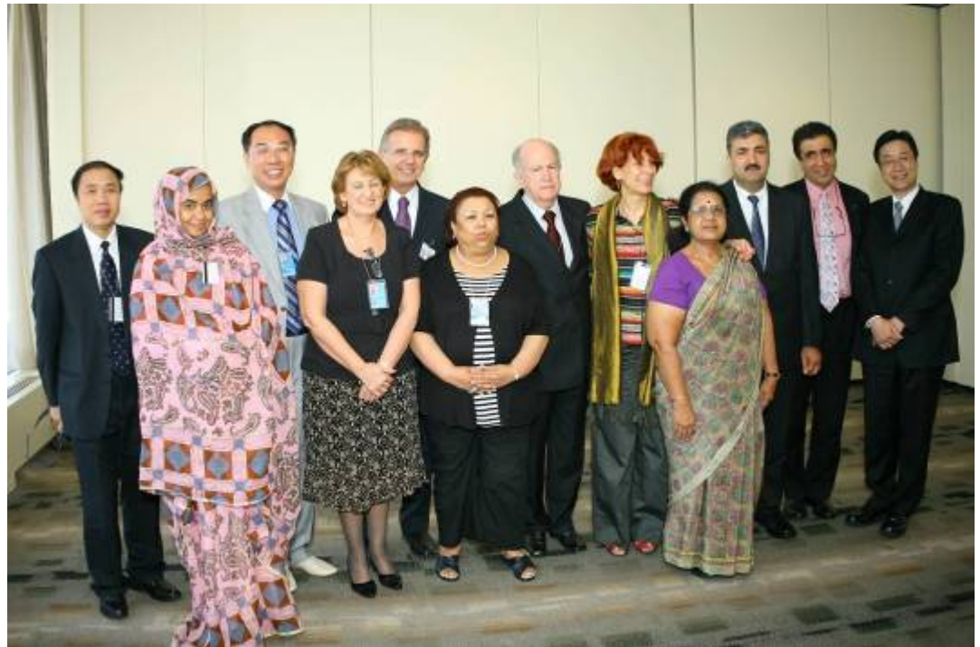
Representation. Experts and regional coordinators from all network regions gathered to celebrate the UN-NGO-IRENE anniversary.