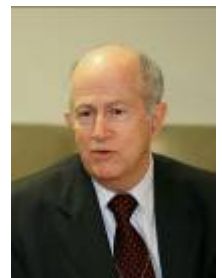
H.E. Dr. Albano Franco

The UN-NGO-IRENE network was created in response to the Secretary-General Report of 1999 to the Assembly underlining that